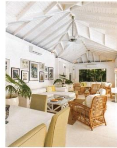
The vast and airy living room.

Point the toes north to some of Seminyak's top culinary destinations including the outlandishly fabulous Searing and nearby popular eatery pasture Peranakan; face south and you are looking at the iconic restaurant and beach club Ku De Ta. The east presents excellent spa and shopping on menus, while west is the white sand and warm waves of the Indian Ocean, just 500 metres from the handicraft, double, Argan blue doors of Villa Lulito. Villa Lulito's designer, Stuart Menbery, knows a thing or two about neo-colonial style. Beyond the threshold of the villa is an elegant oasis with sprawling white-columned pavilions fringed by tropical gardens and centred with a sparkling saltwater pool. Maritime motifs, antique Indonesian prints and an abundance of heavily cushioned cotton furnishing set