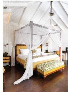
Casual master in the master bedroom.

a sense of cool colonial calm. Gin and tonic, anyone?